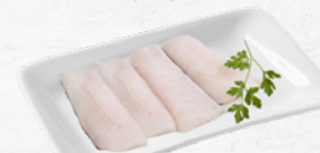
海鲈鱼 Fresh Sea Bass