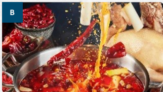
Spicy Marrow Chicken Broth 内蒙清油香辣锅