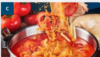
Rich Tomato Broth 维C番茄锅