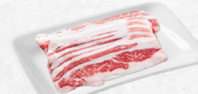
特级牛小排 Superior Short Ribs