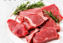
A眼肥牛 Rib Eye