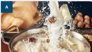
Nourishing Marrow Chicken Broth 滋补清汤锅