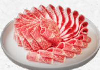
快乐牛板腱 Happy Shoulder Beef