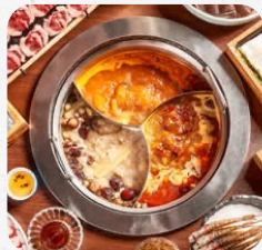
Triple Hot Pot 三味锅 (for larger tables only)