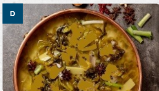
Spicy Sour Pickled Cabbage Broth 金汤酸菜锅