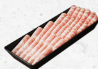
精选肥羊卷 Chef Selected Lamb