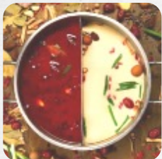
Dual Hot Pot 鸳鸯锅

Our broths are available as a single Hot Pot or