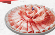
快乐羔羊卷 Happy Spring Lamb