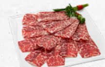
大雪西冷牛 Snowflake Beef Sirloin