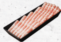
精选肥羊卷 Chef Selected Lamb