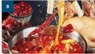
Spicy Marrow Chicken Broth 内蒙清油香辣锅