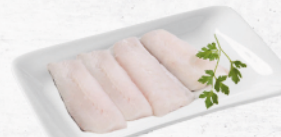
海鲈鱼 Fresh Sea Bass