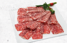
大雪西冷牛 Snowflake Beef Sirloin