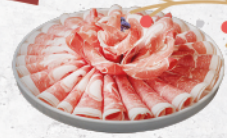
快乐羔羊卷 Happy Spring Lamb