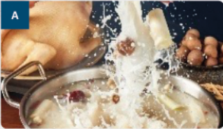
Nourishing Marrow Chicken Broth 滋补清汤锅