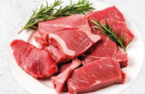
A眼肥牛 Rib Eye