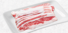
特级牛小排 Superior Short Ribs