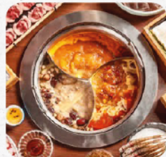
Triple Hot Pot 三味锅 (for larger tables only)