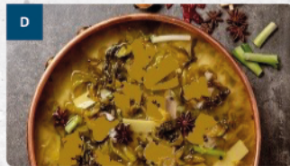
Spicy Sour Pickled Cabbage Broth 金汤酸菜锅