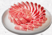
快乐牛板腱 Happy Shoulder Beef