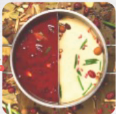
Dual Hot Pot 鸳鸯锅

Our broths are available as a single Hot Pot or