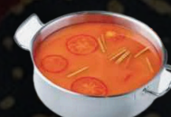
TOMATO (NON VEG)