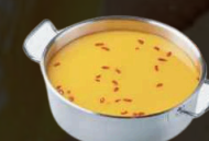
SPICY SOUR CABBAGE